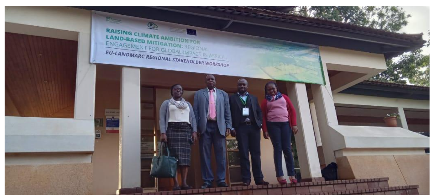
University of Nairobi student, LARMAT Alumni and Staff at the workshop

Staff, Students and LARMAT Alma Mater on 21<sup>st</sup> November 2021 participated in the EU-LANDMARC Regional Stakeholder Workshop, held at ICRAF headquarters Kenya. The regional stakeholder's engagement organized by Stockholm Environment Institute (SEI) focused on enriching understanding of land-based mitigation technologies (LMTs), practices, and their contribution towards High ambitions to reduce global warming by 1.5<sup>o</sup>c.