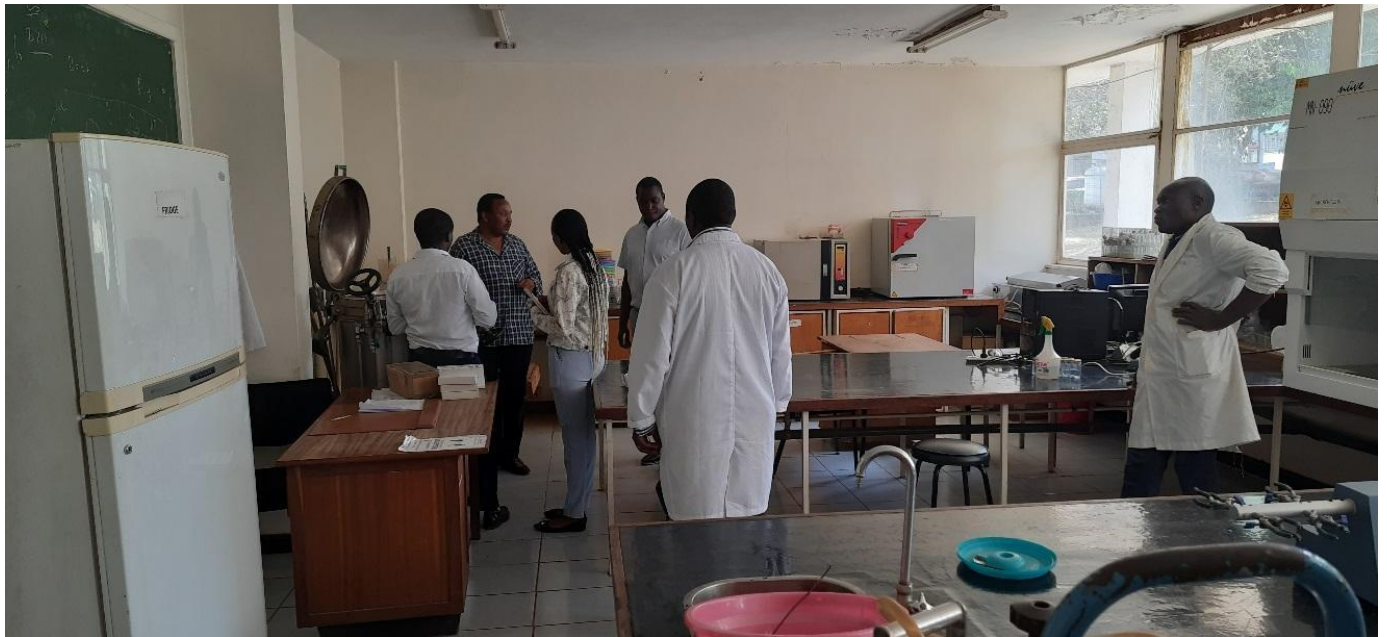
Chief Technologist explaining procedures in the Soil microbiology lab