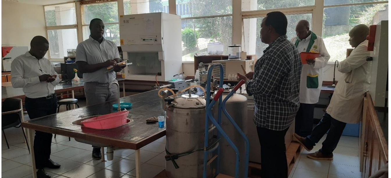
Technologist, explains Microbiology SOPs