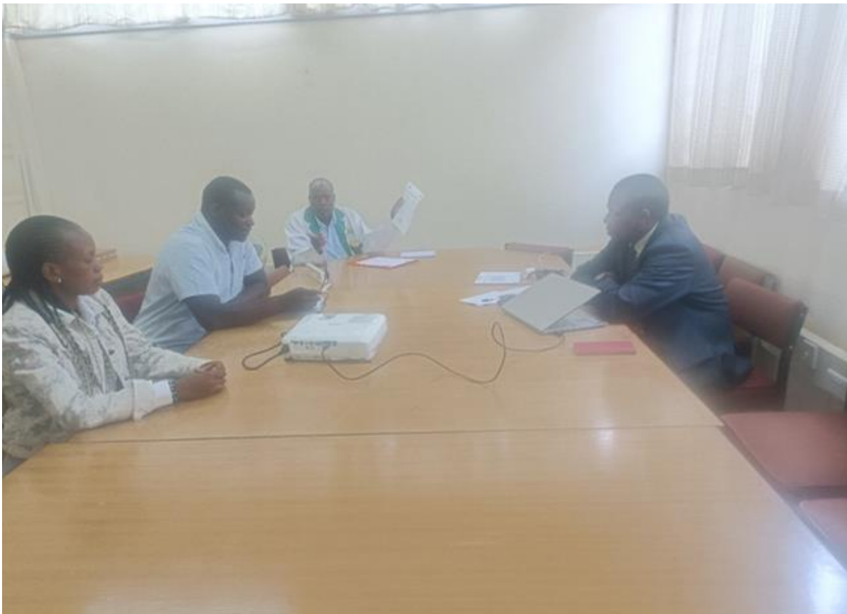
Chairman, LARMAT discussing with KEPHIS inspectorate team