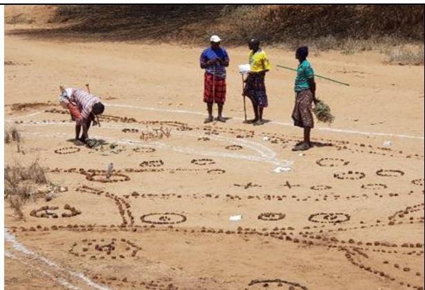
Herders Undertaking Resource Mapping in Sirata Lengamarita Village, Samburu County