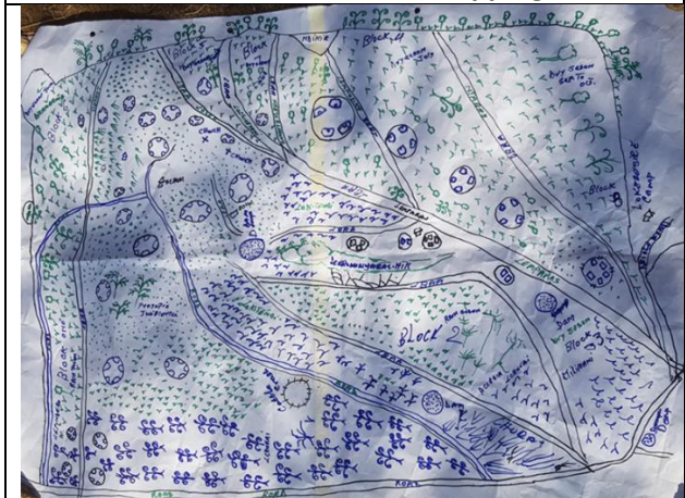
Completed Rangeland Resource Map in Sirata Lengamarita Village, Samburu County