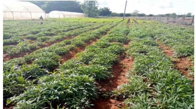
KHYG distributed Orange Fleshed Sweet Potato to Makueni farmers through its activities at the Drylands Research Station