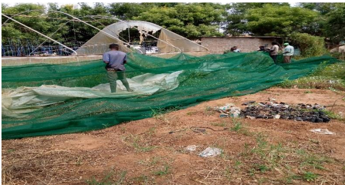
KHYG members rehabilitating a greenhouse at the nearby Kisayani Secondary School through the IITA Start Them Early Program (STEP)