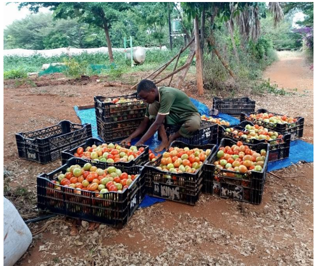
KYHG expertise in greenhouse vegetable production is widely shared with the agricultural community of Makueni County