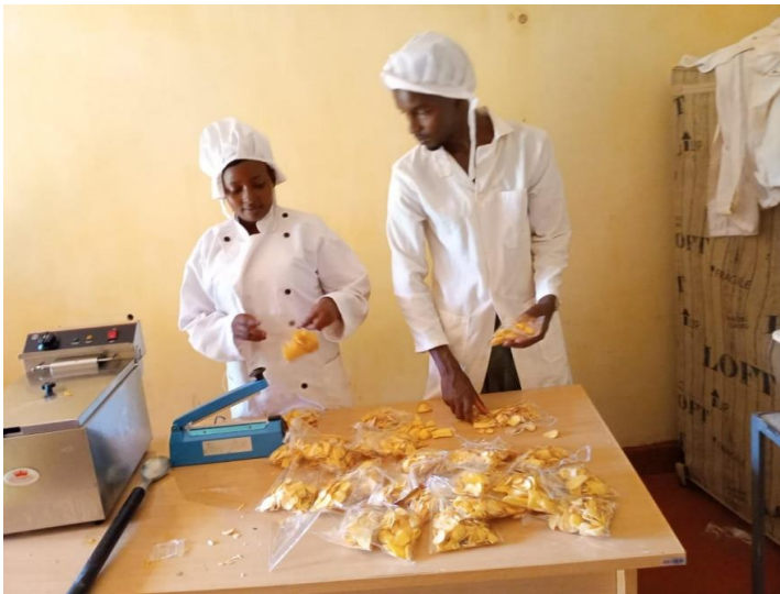
KHYG developed and commercialized a new OFSP crisps product in collaboration with University of Nairobi food scientists