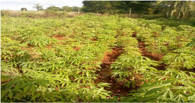
KHYG introduced biofortified vitamin A cassava to Makueni County through its activities at the Drylands Research Station

Photo Gallery: The following annotated photographs capture some of the many activities and community engagements by the Kibwezi Hortipreneur Youth Group