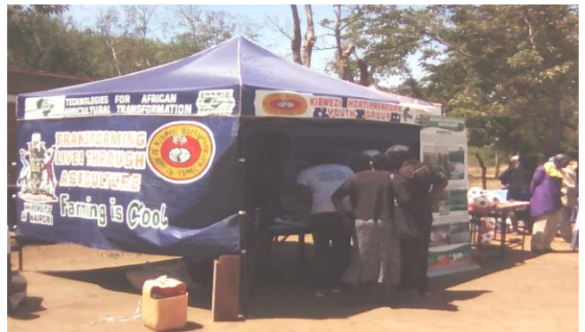
KHYG operates a travelling exhibit and participates in several agricultural and youth events throughout eastern Kenya