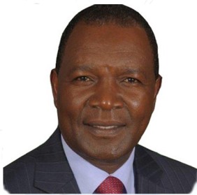
PROF. NJUNGUNA NDUNG'U EXECUTIVE DIRECTOR AERC KEYNOTE SPEAKER