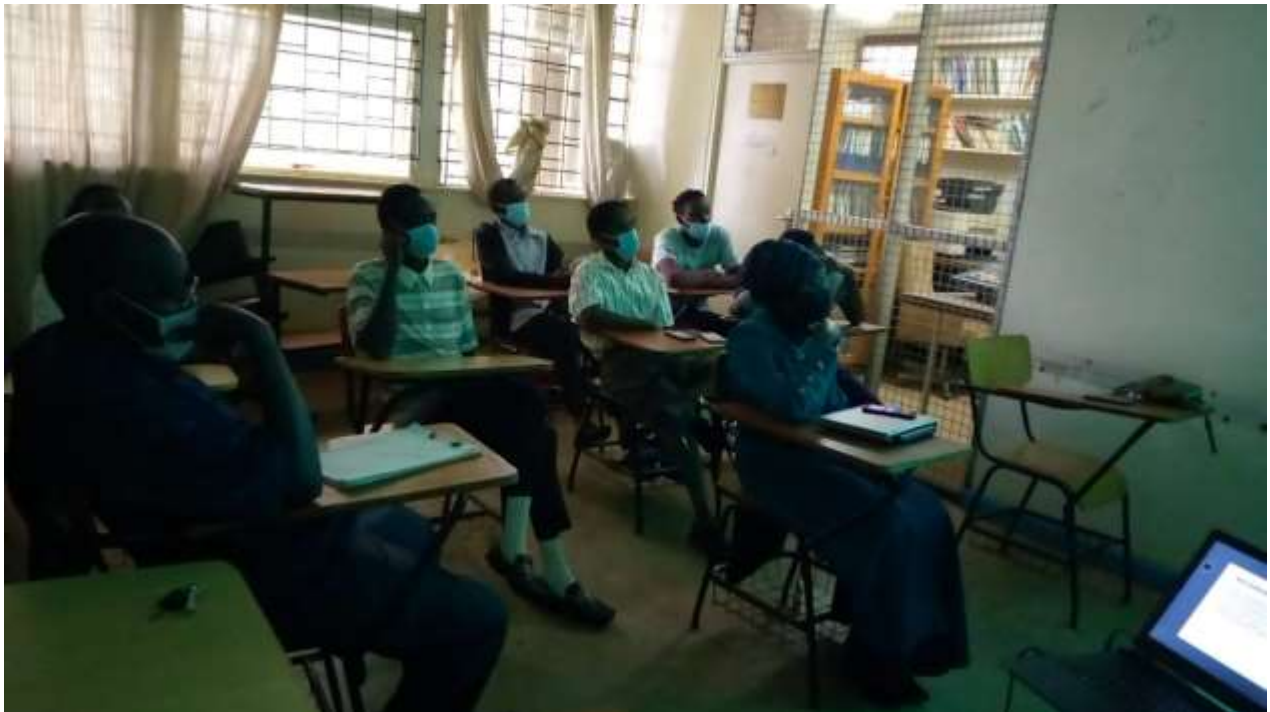
Group 2: Presentation – 5/3/2021